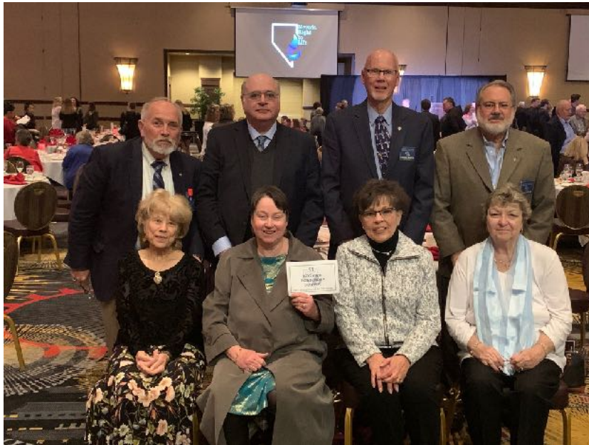
Photo-left to right, (with their wives seated) of Ponderosa Council 4928:

Numerous Politicians, both past and present were in attendance, all of whom are identified as Pro-Life supporters, this being an election year, we need to know them by their face, name and that they stand with us! On the table, this year is a Statutory Initiative in Nevada for Parental Notification (regarding a minor having an abortion).