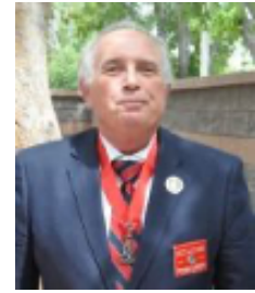
Council #4928 Program Director

Now, approaching some ten years, Ponderosa Council 4928 has participated in the Friends for Life Dinner & Auction, purchasing a table for eight. The Council purchases the table from it's General Fund, made possible through our 3 major outside fund-raising events.