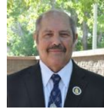
State Warden State Membership Director