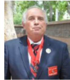
Council #4928 Program Director