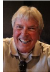
State Retention Director